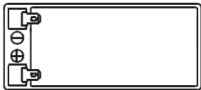
F1 (FASTON TAB NO. 187)